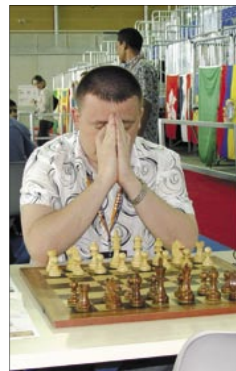
23...Rxf2!? or 24...Rxf2! Spectacular but not necessary. The winning